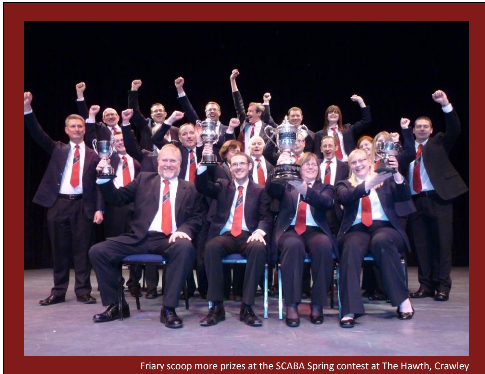
Friary scoop more prizes at the SCABA Spring contest at The Hawth, Crawley

As we move out of the depths of winter, Friary embark on its busiest contest run of the year, kicking off with the Area contest in March through to the Whit Friday Marches in June with trips to Crawley and Blackpool in between. The Band also held its AGM in April, taking stock of the previous year's achievements and planning for the year ahead. There is an exciting line-up of concerts for the summer season too, so read on to find out more!