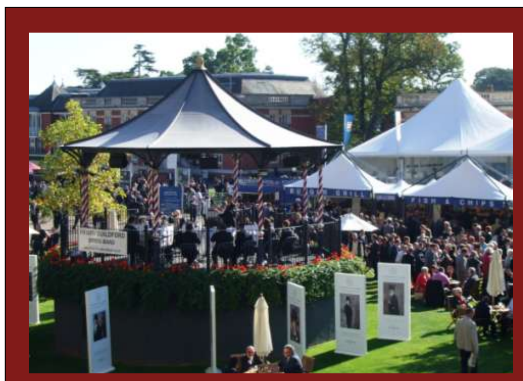
Friary ten piece ensemble perform on the bandstand at Ascot racecourse

As the summer concert season ends, Friary begin contesting again and travel as far afield as Middlesbrough and Folkestone, whilst also performing at one of the UK's premier sporting locations, Ascot racecourse. In other news, Friary begin the search for a new bandroom as their current rehearsal facility at Greenfield School in Woking will not be available for hire at the end of the current school term.